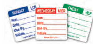
5cm prep labels (rolls of 250)