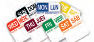
2.5cm day dots (rolls of 1000)